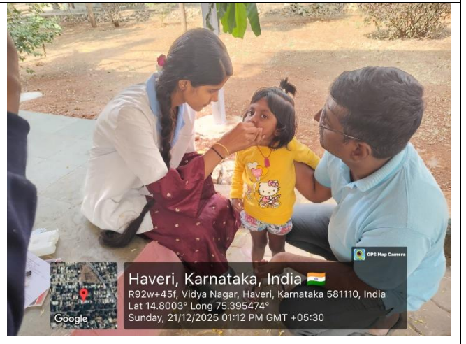
Haveri, Karnataka, India R92w+45f, Vidya Nagar, Haveri, Karnataka 581110, India Lat 14.8003° Long 75.395474° Sunday, 21/12/2025 01:12 PM GMT +05:30