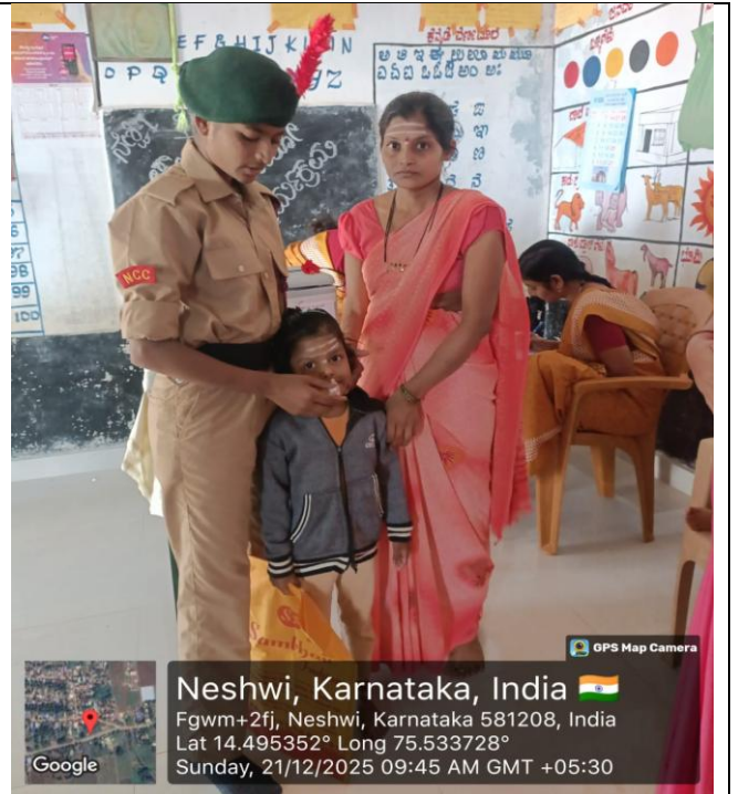
Neshwi, Karnataka, India Fgwm+2fj, Neshwi, Karnataka 581208, India Lat 14.495352° Long 75.533728° Sunday, 21/12/2025 09:45 AM GMT +05:30