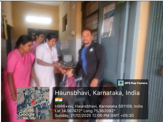
Haunsbhavi, Karnataka, India H986+xvj, Haunsbhavi, Karnataka 581109, India Lat 14.567472° Long 75.362092° Sunday, 21/12/2025 12:06 PM GMT +05:30