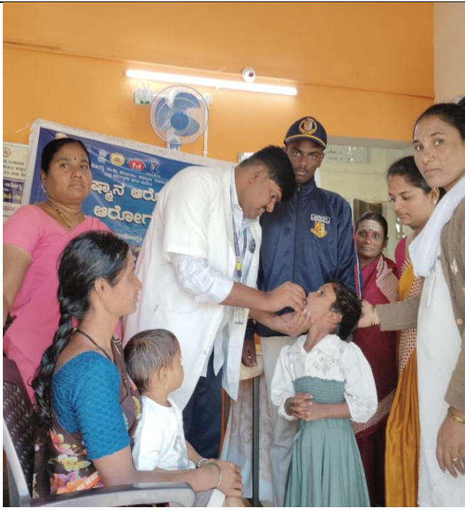
Location: Chikka Kuravatti